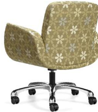
2811-8 Medium Back Swivel - Back view

Fashion finds the workplace in this contemporary seating series for meeting areas, customer centers, presentation facilities, low-task office applications, lounge and reception areas. Kate is available with two different mechanisms, features pneumatic height adjustment and a beautiful, polished aluminum die-cast base with twin wheel hooded casters. Very chic. Very affordable.